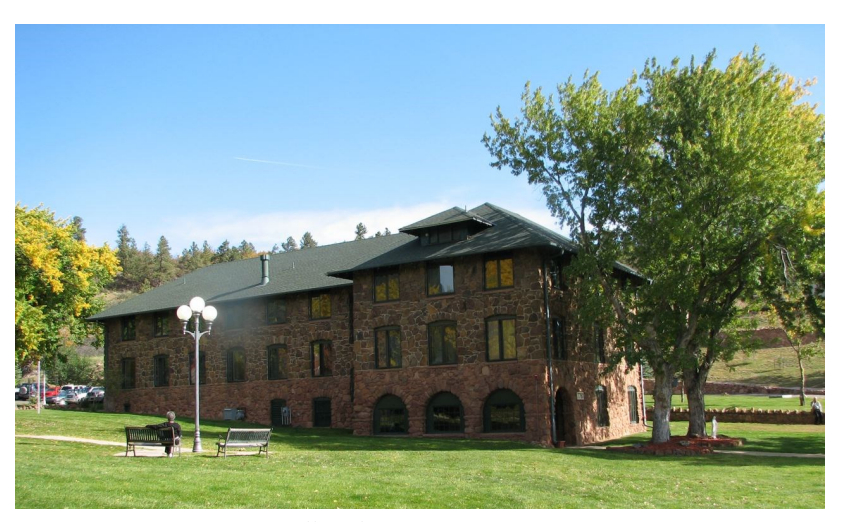
Marian Hall at the Franciscan Retreat Center

The retreat will be held at the <u>Franciscan Retreat Center</u> in Colorado Springs. Registration deadline is September 23.