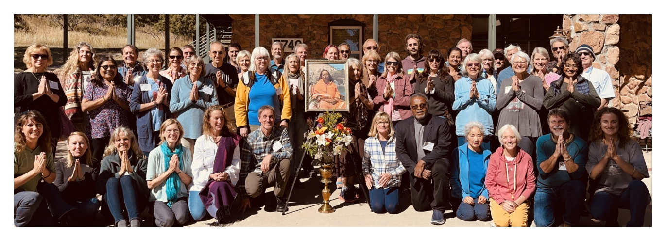
Rocky Mountain Yogis Retreat in Colorado Springs, Colorado, 2023

Check-in is from 3:00 - 5:00 p.m. on Friday and the retreat ends at 1:30 p.m. on Sunday. A detailed retreat schedule will be emailed to registrants in September.